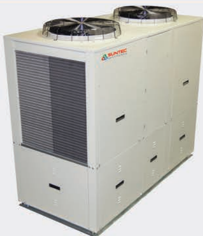
Air Cooled 1 to 40 TR